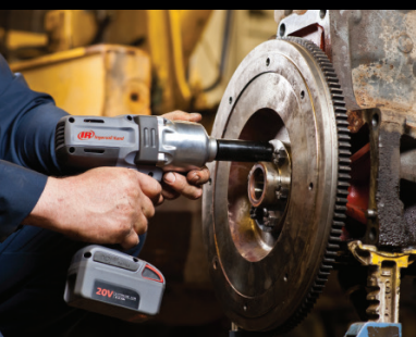
Machinery Installation and Repair